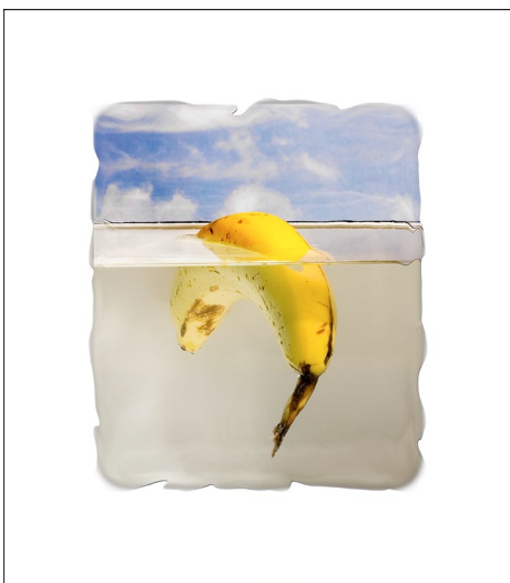
Banana Island Edition of 5 at 17cm x 15cm