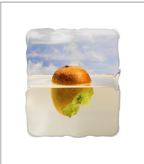
Kiwi Island Edition of 5 at 17cm x 15cm