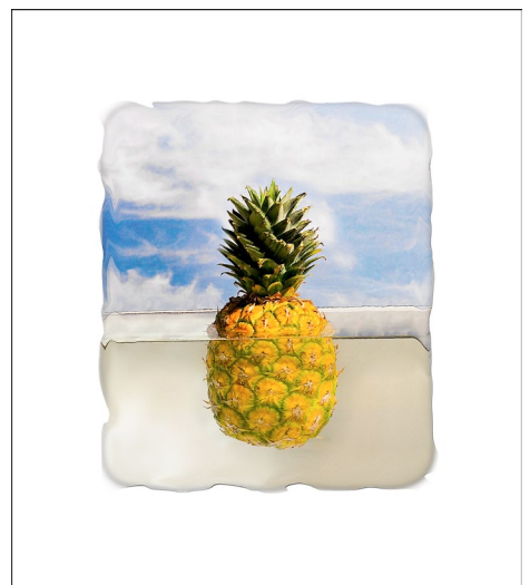
Pineapple Island Edition of 5 at 17cm x 15cm