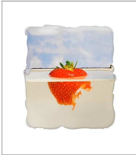
Strawberry Island Edition of 5 at 17cm x 15cm