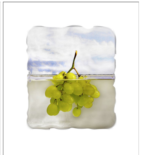
Grape Island Edition of 5 at 17cm x 15cm