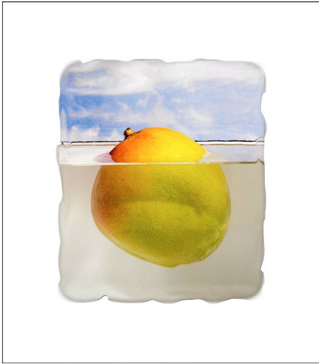
Mango Island Edition of 5 at 17cm x 15cm