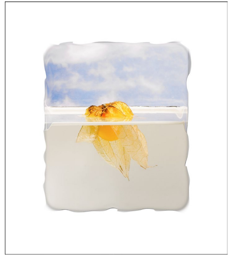
Physalis Island Edition of 5 at 17cm x 15cm