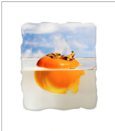
Kaki Island Edition of 5 at 17cm x 15cm